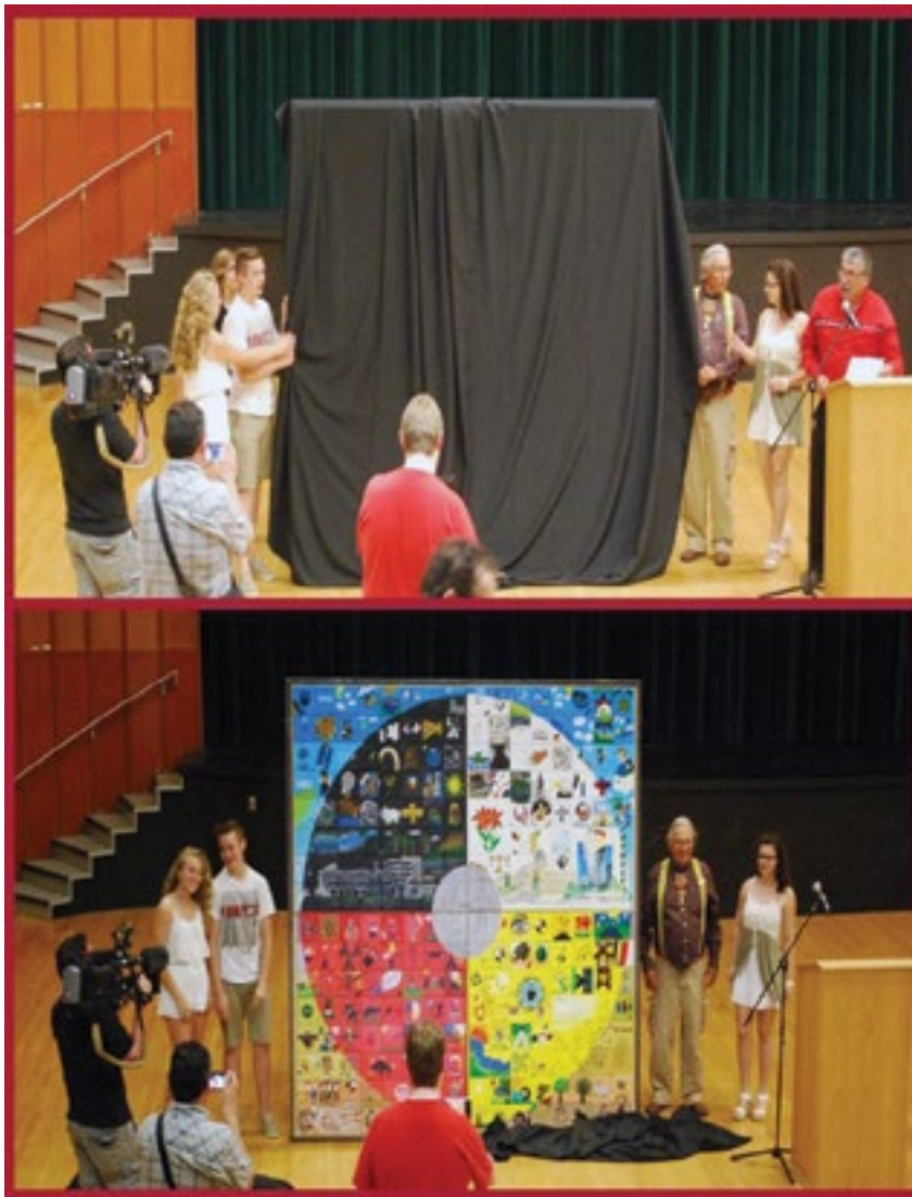
The official unveiling

A week after the youth conference, participating Grade 9 students were asked to create an album illustré in their Français arts langagiers class. It would be a kind of graphic novel, based on what they had taken away from their most meaningful workshop session. Students started by writing a 400-word expository text that began with a question or problem and then explained what had happened in the past and what was happening in the present. Next, they created the graphic novel which gave them a chance to provide new information through storytelling. Finally, they wrote a persuasive paragraph that suggested solutions or made a call to action. The images illustrating the texts were then combined to complete the album illustré .