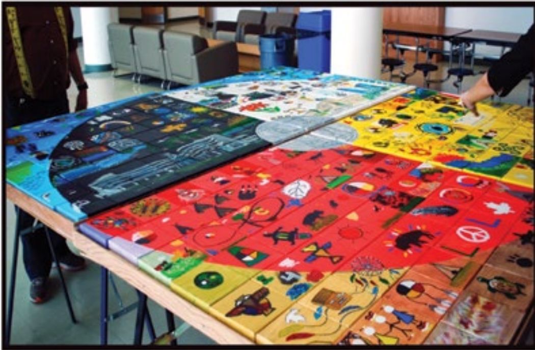
... Our piece coming together

The completed work is shown in the picture below, depicting treaty citizenship as it was understood by 220 students from four Regina public high schools. At the end of the day, students and staff gathered to celebrate their achievements and reflect on the work that they had done.